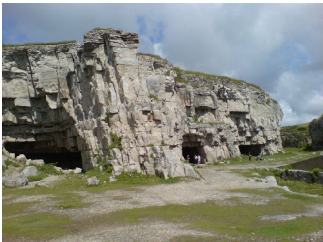
Winspit Quarry on a good day could be The Orkneys?

am) we started work. There were some 30 'labourers' and we were each allotted a task. Mine was to stand at a table sifting and examining bits of rock. The young American director then moved among us greeting us all and generally getting us on on his side - quite a rare phenomenon, I was told, as most directors treat extras as though they don't exist.