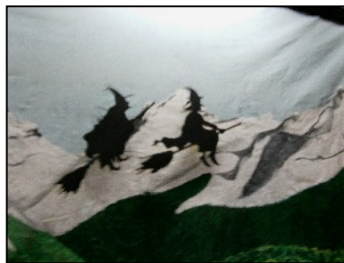
Somewhere over the Ramtops witches fly