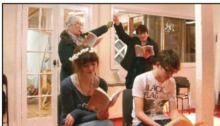
Wyrd Sisters and the Fool in rehearsal

The only person who could take the throne would be the missing infant Prince. Hunted by the Duke's men the baby finds safety under the protection of three local witches, Granny Weatherwax, Nanny Ogg and Magrat Garlick. The witches have a rule never to interfere but with the life of a child at stake and the fate of the Kingdom at hand, Granny has a saying about rules, if you're going to break them "Break them good." and hard!"