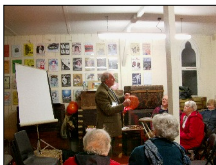
Revealed: why the balloon wouldn't pop

And then, following some absolutely hilarious video clips from his productions, the evening was topped off with almost everyone playing a part in a spirited read-through of Act 2,