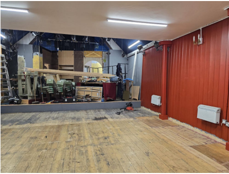
The floor before.....