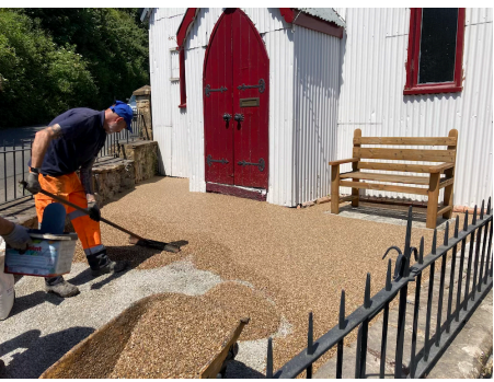
Work in progress (2)

Once again, we wish to express our gratitude to the Linbury Trust and to the Small Grants Programme of the Theatre Trust , for their generous award of the grant which enabled this project to be undertaken.