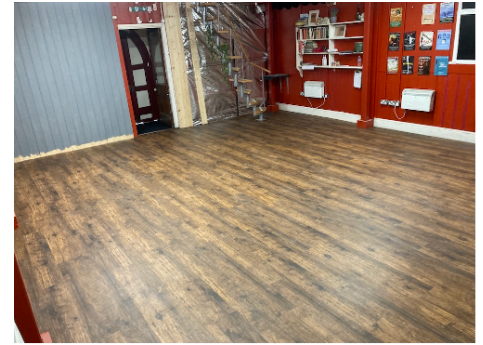
The new floor

The new floor in the auditorium and foyer (as reported previously) was laid by Steve Jackson Carpet and Flooring of Sherborne , but involved the removal and later replacement of the entire contents of the auditorium, by a team of willing APS volunteers. As well as its visual appeal, draughts have now been eliminated - or at least