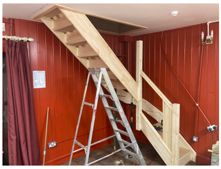
Work in progress (3)

much-hated stairs have now been replaced by a magnificent new bespoke staircase, designed, built and installed by Maurice Watts of Dorchester . This