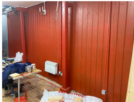
Work in progress (1)

The high quality of the woodwork and painting is testament to the time and patience which has been devoted to this project.