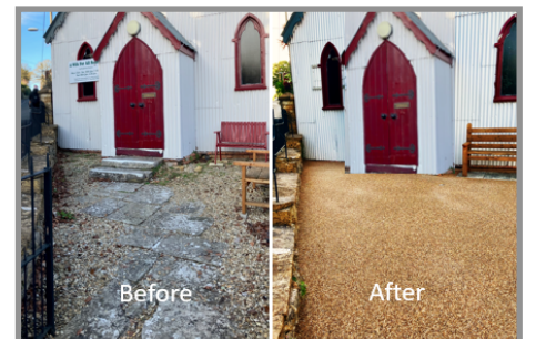
Thank you, Theatres Trust Small Grants Programme supported by The Linbury Trust