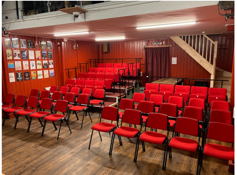
“In situ” - new seating, floor, walls and staircase

The seating has already been trialled and met with great approval.