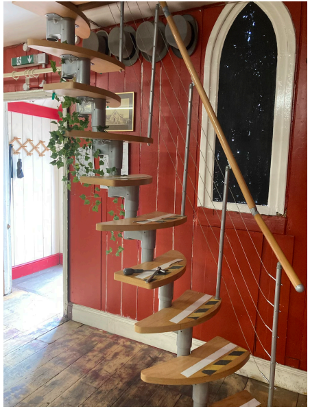
The old stairs

Most audience members will have given scant attention to the precipitous and potentially very dangerous stairs, which used to lead from the bar area to the gallery (hence only used by technical crew, bar and wardrobe staff). But we are delighted to report that those